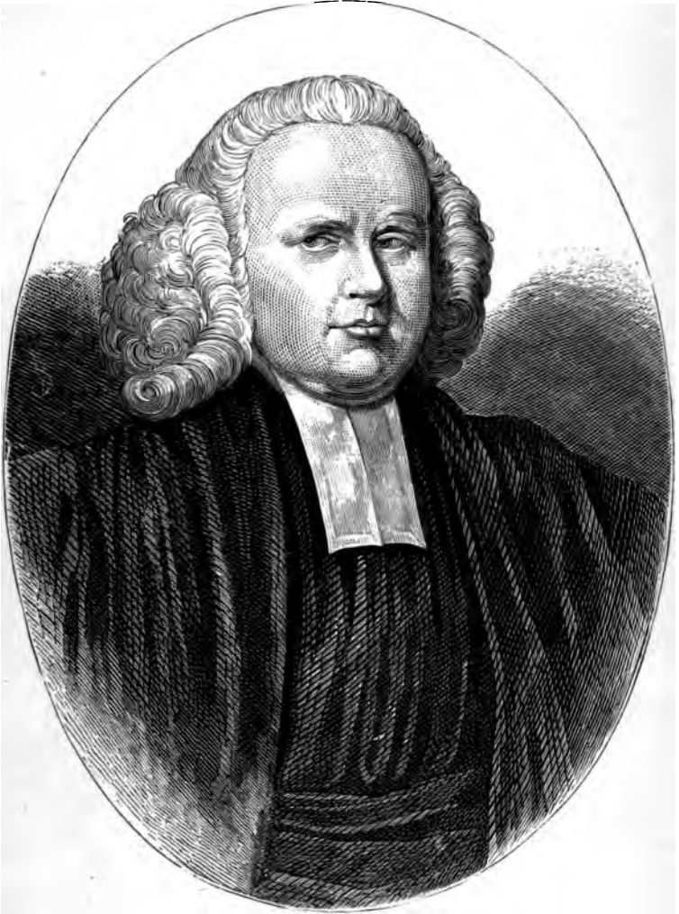
REV. GEORGE WHITEFIELD.